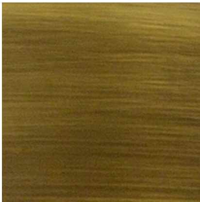
998 WEATHERED BRASS