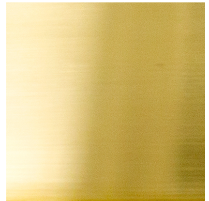
997 RAW BRASS