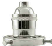
NS NICKEL SOCKET & NO SWITCH