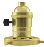
BP BRASS SOCKET & BLACK PADDLE SWITCH