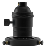
UP BLACK SOCKET & BLACK PADDLE SWITCH