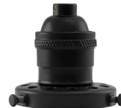
US BLACK SOCKET & NO SWITCH