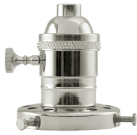
NK NICKEL SOCKET & KNOB SWITCH