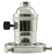
NP NICKEL SOCKET & BLACK PADDLE SWITCH