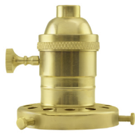
BK BRASS SOCKET & KNOB SWITCH