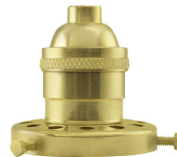
BS BRASS SOCKET & NO SWITCH