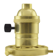
BP BRASS SOCKET & BLACK PADDLE SWITCH