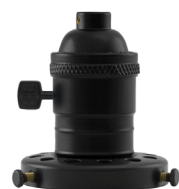
UP BLACK SOCKET & BLACK PADDLE SWITCH