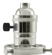
NP NICKEL SOCKET & BLACK PADDLE SWITCH