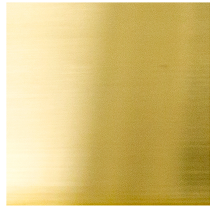
997 RAW BRASS